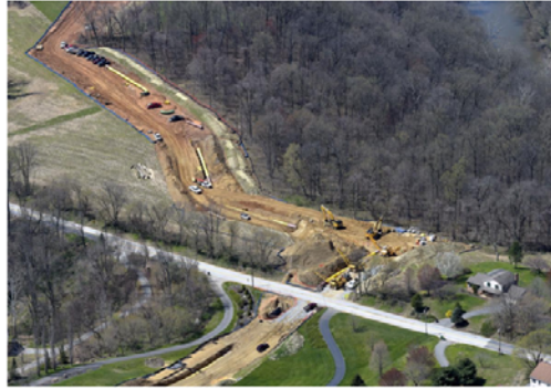
The Atlantic Sunrise gas pipeline is bored under Main Street west of Conowingo. In this aerial photo taken April 18, 2018.