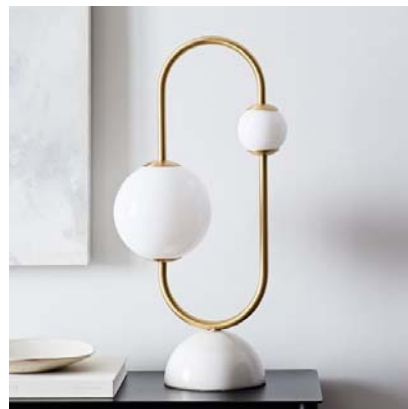
WEST ELM® Table Lamp (a useful article)

utilitarian function , in respect of an article, means a function other than merely serving as a substrate or carrier for artistic or literary matter .